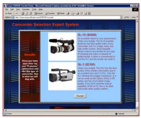
Exsys Servlet Runtime