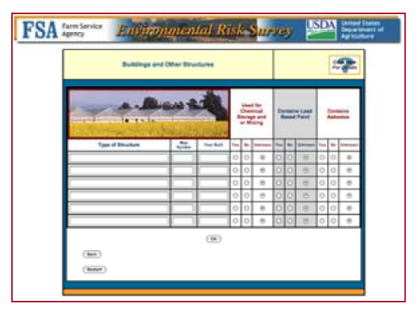
Exsys Servlet Runtime